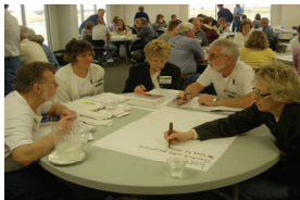
The Big Springs ABIDE team collaborates on a vision for the future.

A team composed of the pastor and 4-12 lay people