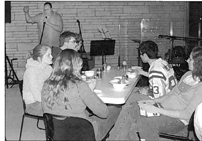
Students at K-State Wesley eat Sunday night meals together.