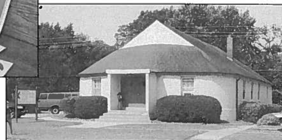
Mision La Esperanza in Emporia