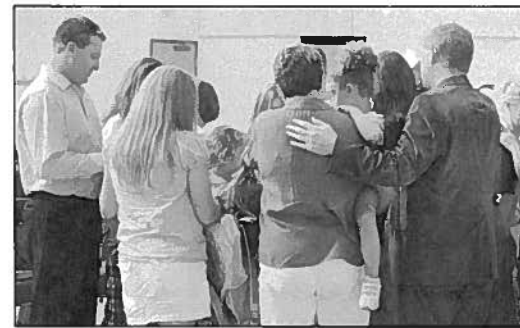
Worshippers at Living Water, a new church start in Piper.

A number of factors play into the decision to plant a new church, including geography, population growth and how the church is serving changing demographics. These factors have led to the planting of two Hispanic churches, one in Kansas City and another in Holton. ■