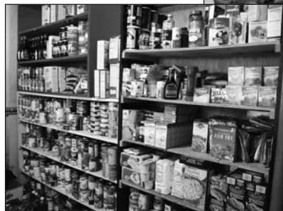
Ogden Friendship House